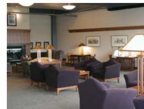
The Houghton Room is quickly becoming Tigard's Living Room.