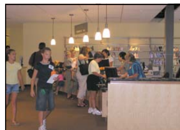
The check-out desk has remained busy ever since the grand opening.