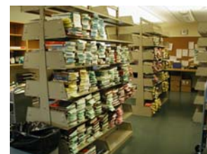
Some of the many books and materials processed by Technical Services