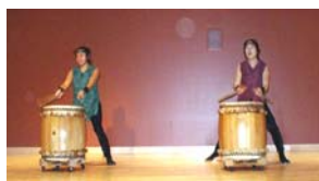
Portland Taiko enthralled audiences with their animated drumming.

In addition to the many jobs and tasks they accomplish, volunteers form an effective corps of library ambassadors in the community.