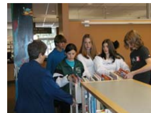
Volunteers receive instructions before shelving in Children's area.