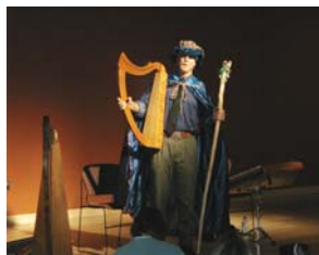
The Magical Strings bring Celtic tunes and tales to Tigard.