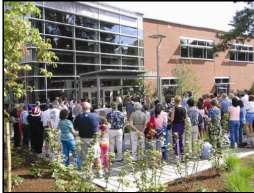
Excited patrons arrive at Grand Opening on Aug. 21.

On Aug. 4 more than 200 people, mainly children, helped move a final piece of the library