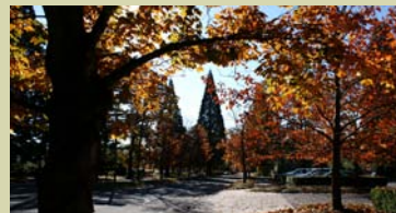
Fall in the Triangle Kathy Vincent

The development of an Urban Forest Master Plan will allow for a more comprehensive approach to future City decisions concerning trees.