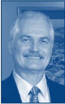
Mayor Craig Dirksen

City Council meets each year to determine the direction the city should move with the resources we have available. The goals below reflect our aspirations for 2012. One thing that doesn't change is our commitment to the community. Remember, we're not just City Councilors, we live here and we care about the same things that you do.