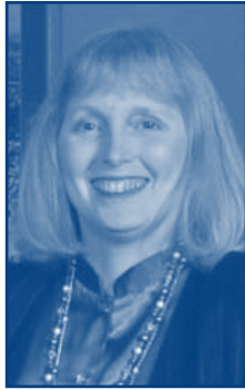
Council Pres. Gretchen Buehner