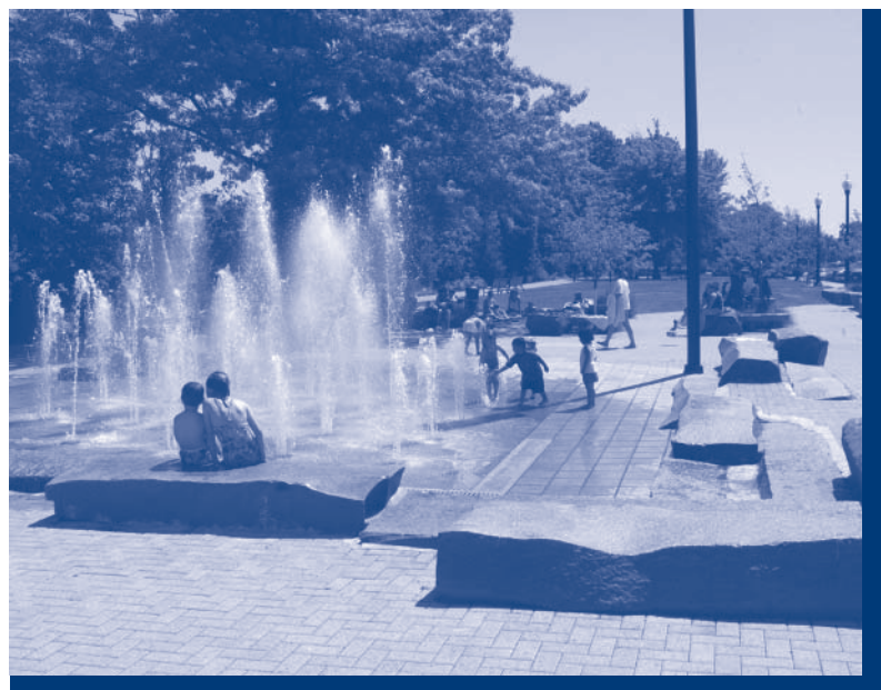
Riverfront Commemorative Park in Corvallis