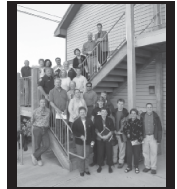
Downtown Task Force Members

The Downtown Task Force is composed of 24 volunteers appointed by the Tigard City Council. We are residents, property and small business owners – we are your neighbors.