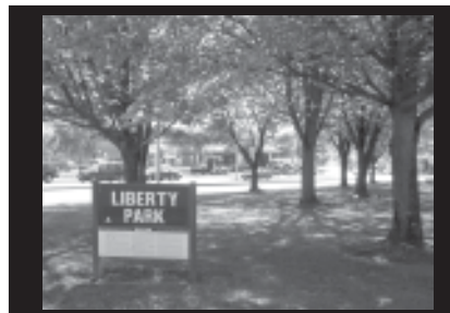
Northern Gateway into Downtown Tigard