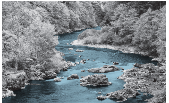
The Clackamas River is a high quality water source.

Effective January 1, 2012, water rates will increase 14 percent. Under the new rates, a typical residential customer should expect to pay $5 to $8 more per month. Each customer's bill will vary based on water consumption, the size of their water meter and pumping charges, where applicable. This is the second of several increases that will take place through the year 2015.